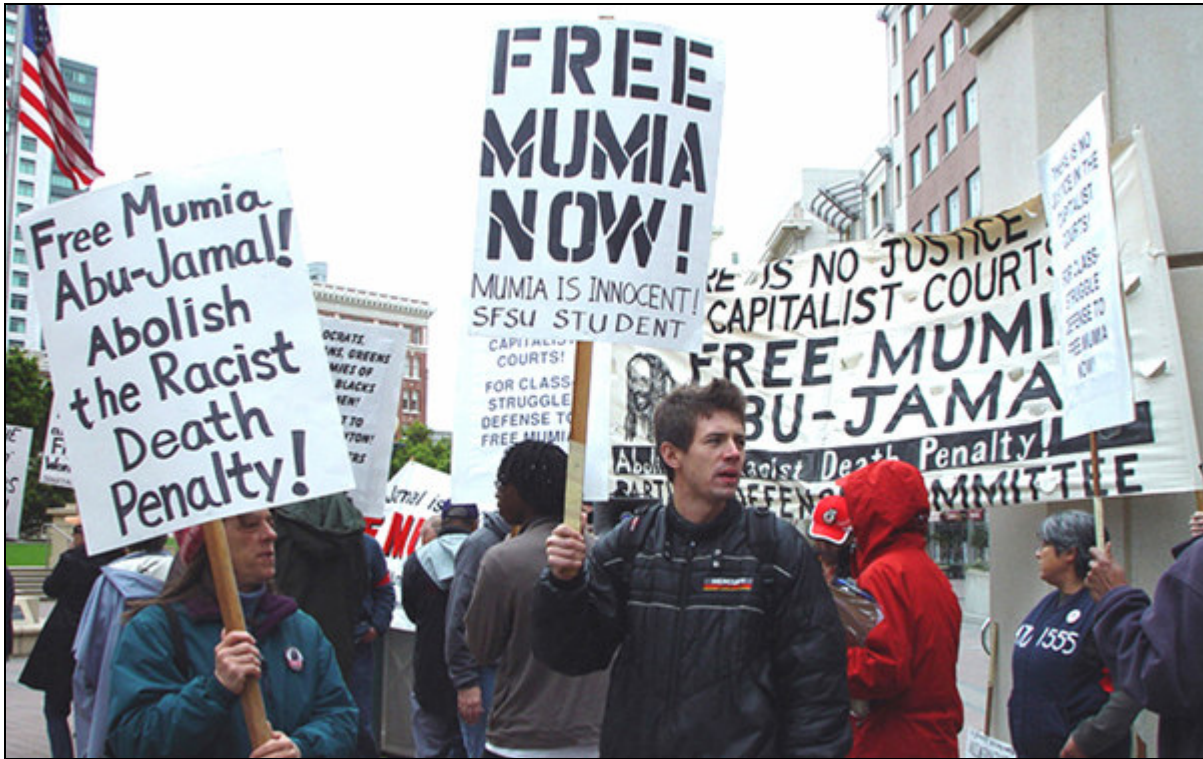
March 28, 2008: Downtown Oakland emergency protest initiated by Partisan Defense Committee and Labor Black League on behalf of Mumia Abu-Jamal drew over 100 demonstrators.

Opponents of racist injustice at SFSU endorse the urgent call for worldwide united-front protests to demand: