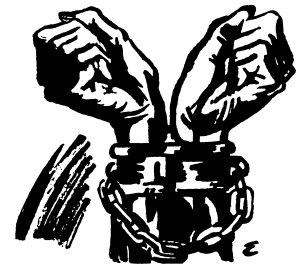
Labor Defender, December 1927

For more information: (510) 839-0852 or e-mail: pdcbayarea@fastmail.net website: partisandefense.org