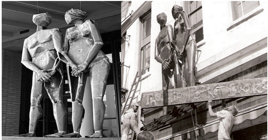
FOCAL POINT — 1965