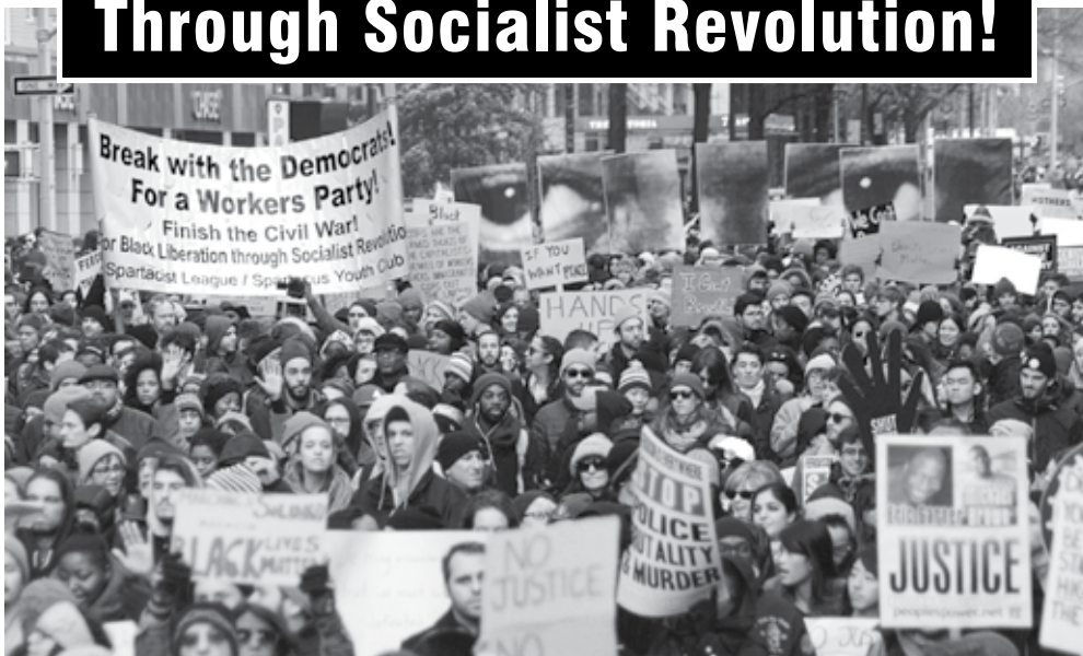
Top: Frederick Douglass, seated at left, at anti-slavery convention in New York State, 1850. Bottom: Spartacist banner at "Millions March NYC" demonstration against racist police killings, 13 December 2014.

Finish the Civil War! For Black Liberation Through Socialist Revolution!