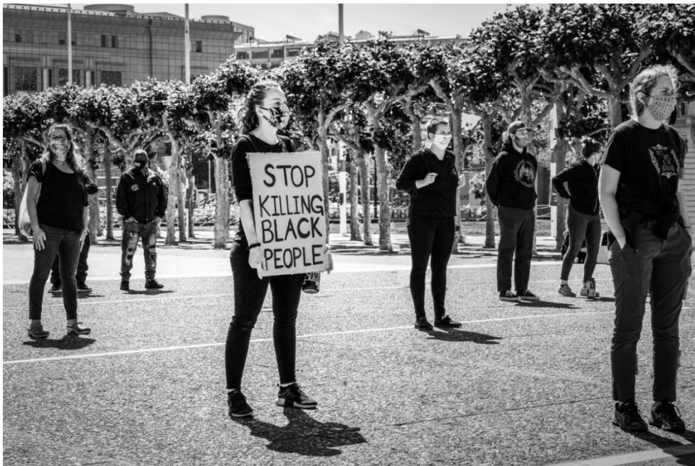
BLM Protest, San Francisco, June 1, 2020.